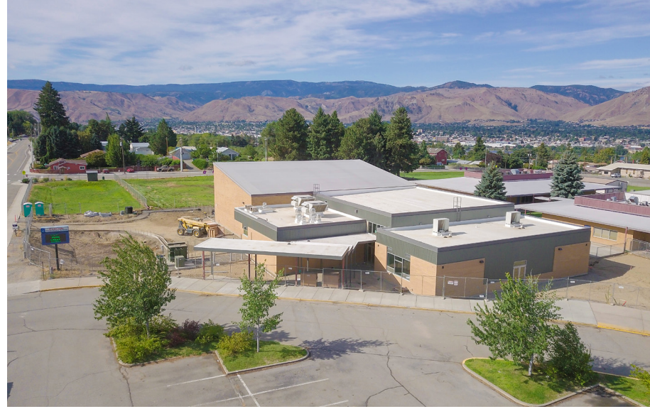
Cascade (pictured here), Lee and Rock Island elementary schools all received new roofs as part of the school district's construction projects.

expected to be more than originally stated.