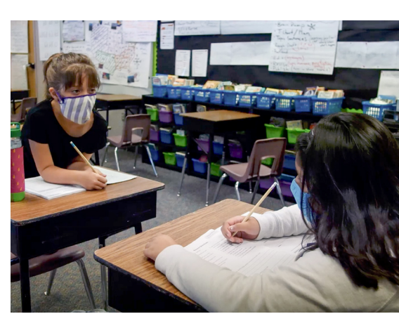
Summer school students work on a writing exercise at Grant Elementary.