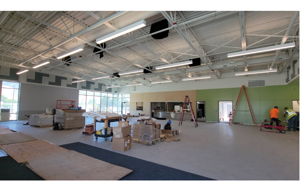
This new cafeteria and kitchen is part of the expansion and renovation project at Rock Island Elementary. The new annex also adds new classrooms and an adjacent parking lot.

"You take a look at what we've done with the limited funds we had for these